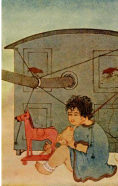
From a drawing by Nandalall Bose

Mother, let us imagine we are travelling, and passing through a strange and dangerous country.