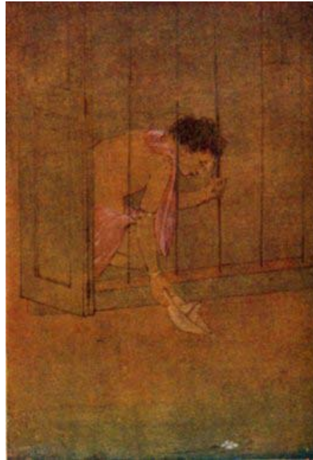
From a drawing by Surendranath Ganguli

Day by day I float my paper boats one by one down the running stream.