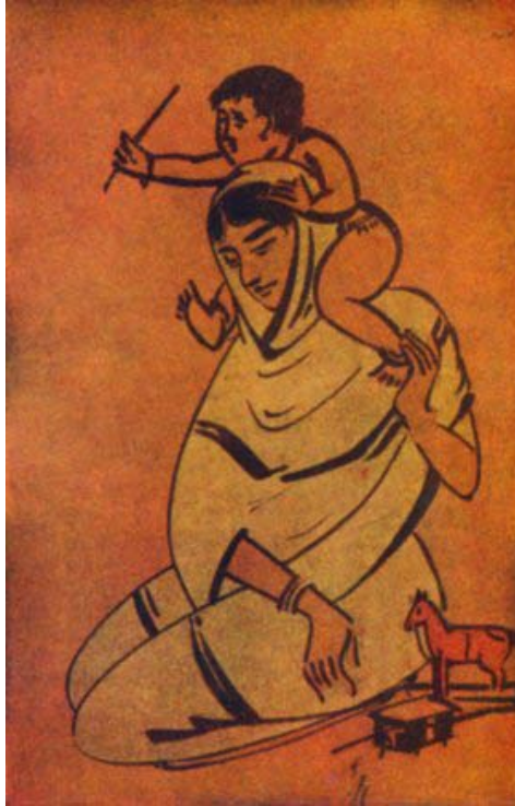
The Home--from a drawing by Nandalall Bose

I paced alone on the road across the field while the sunset was hiding its last gold like a miser.